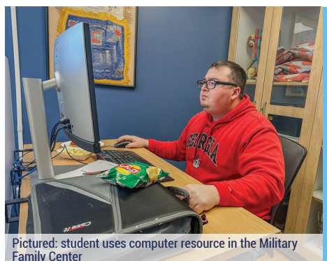
Pictured: student uses computer resource in the Military Family Center

Two key spaces - the Native + Indigenous Culture Center and the Military Family Center - have moved into newly renovated, welcoming areas with upgraded amenities and expanded resources tailored to the communities they serve. A refreshed study lounge in the Marias Wing rounds out the transformation, offering a flexible, comfortable environment for all students.